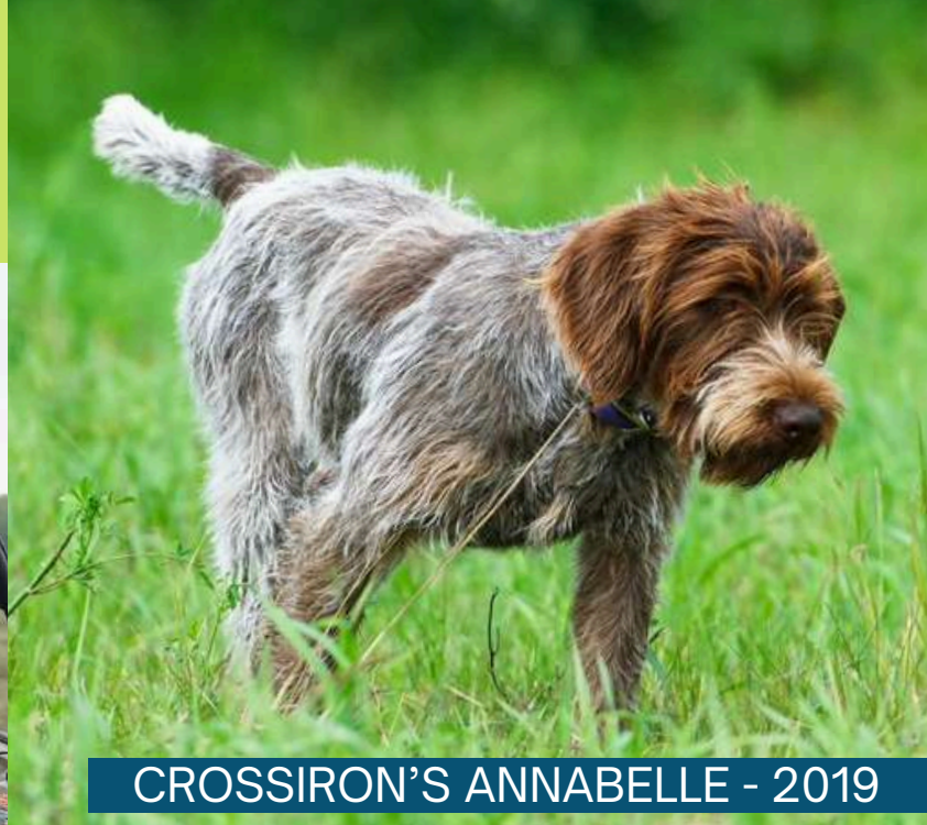
CROSSIRON'S ANNABELLE - 2019