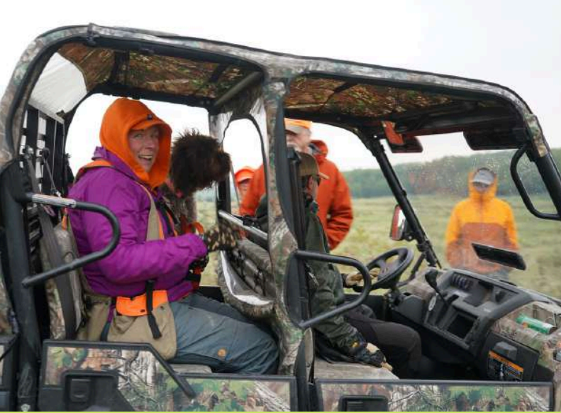
UT TEST - AUG 18 2023 - Prize I

A few attempts and a gamut of scores later, we finally got the prize 1 we had been working towards. After some humming and hawing about what to do next, I thought what have we got to lose, lets go for it. Lets go to the Invitational! I will say it's probably good I didn't really know what new skills Belle and I had to learn at that point, because I may have thrown in the towel right then and there. Instead, we buckled up and travelled to the US to train with other IT bound members and their dogs, got lots of helps from our local chapter, and amazingly enough, made our way to Iowa in September. It was quite an amazing feeling standing in the lineup in the morning while they presented everyone that was running that day as the sun was starting to come up. I was excited. And nervous. And dare I say proud.