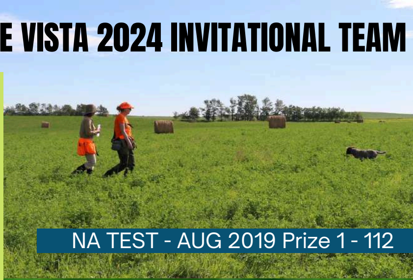
NA TEST - AUG 2019 Prize 1 - 112

A few attempts and a gamut of scores later, we finally got the prize 1 we had been working towards. After some humming and hawing about what to do next, I thought what have we got to lose, lets go for it. Lets go to the Invitational! I will say it's probably good I didn't really know what new skills Belle and I had to learn at that point, because I may have thrown in the towel right then and there. Instead, we buckled up and travelled to the US to train with other IT bound members and their dogs, got lots of helps from our local chapter, and amazingly enough, made our way to Iowa in September. It was quite an amazing feeling standing in the lineup in the morning while they presented everyone that was running that day as the sun was starting to come up. I was excited. And nervous. And dare I say proud.